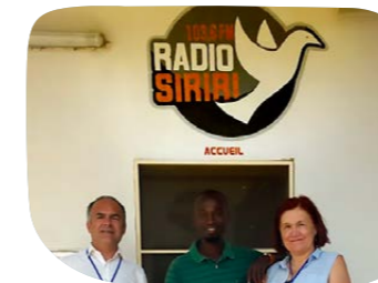
Radio SIRIRI in Bouar