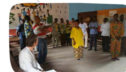
Learning Through Play in CAR