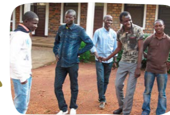
Scholarship for 16 students