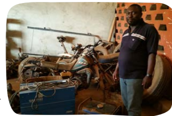
School for automobile mechanics in Baoro