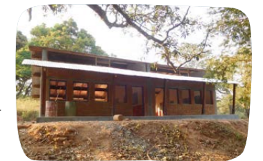
Building of 2 new school classrooms