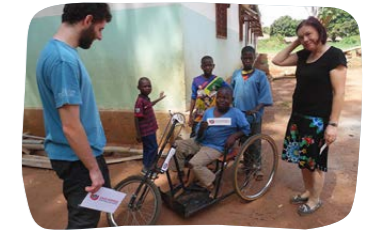
Health – Strengthening the capacity of the St. Michael's Coordination Center in Bouar in caring for and assisting people with HIV / AIDS