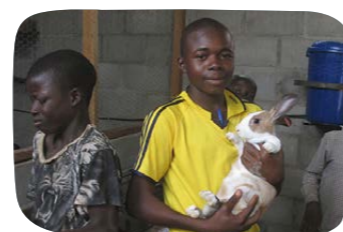
Tutoring for students in Bouar