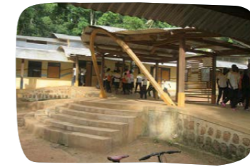
High school in Bozoum

Grant from the Czech Ministry of Foreign Affairs: 190 000 € Main sponsors for the Learning Through Play program: 6 000 € Individual donors: 115 500 € Grant from the Czech Embassy in Nigeria: 20 000 € Total investments made by SIRIRI in CAR: 331 500 €