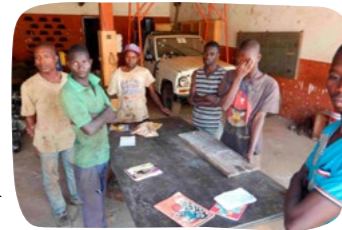
School for car mechanics in Baoro