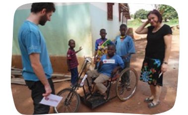
Santé – Strengthening the capacity of the St. Michael's Coordination Center in Bouar in teaching and assisting people with HIV / AIDS