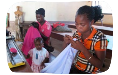
Educational center for women "Kana"