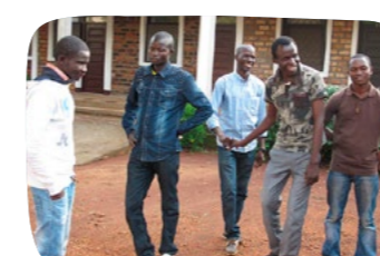
Scholarship for 16 students