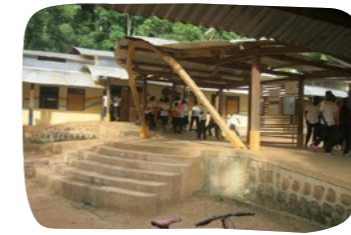
High school in Bozoum