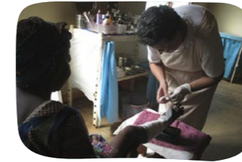
Fund for first aid