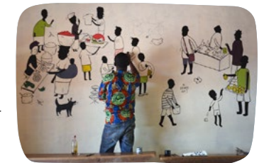
Painting of 25 murals with educational themes in schools

Costs €14 400 (Czech Embassy in Nigeria in Abuja)