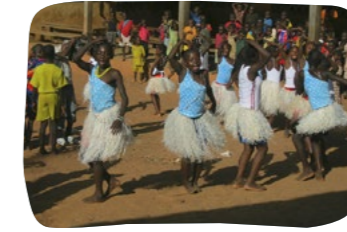
Orphanage care centre "Arc-en-ciel"