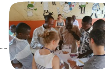
Learning Through Play in CAR